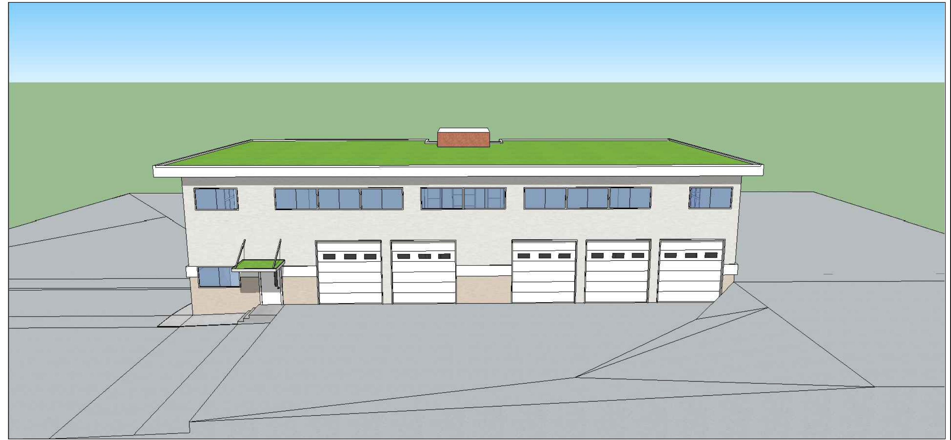
2 SOUTH ELEVATION A3