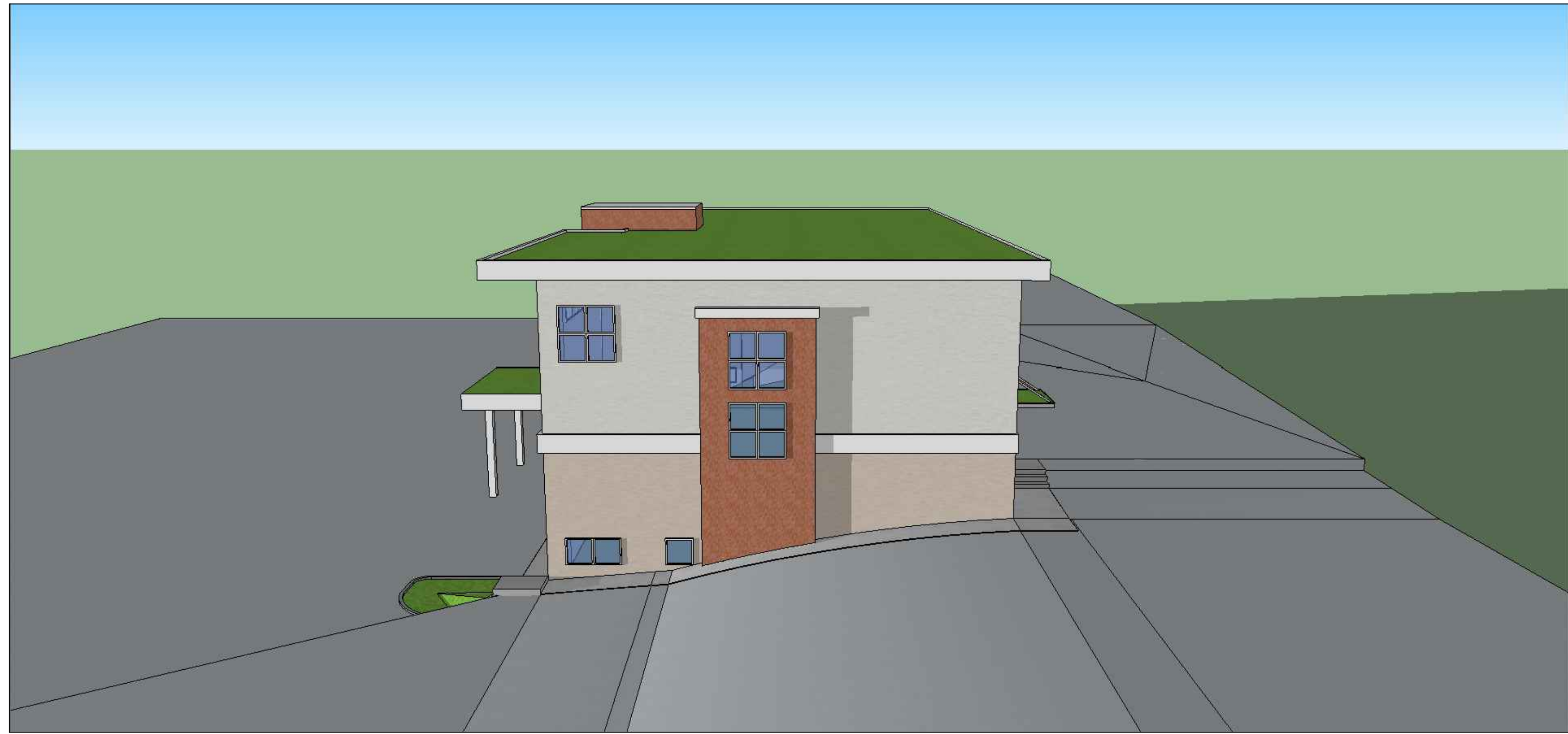
1 WEST ELEVATION A3