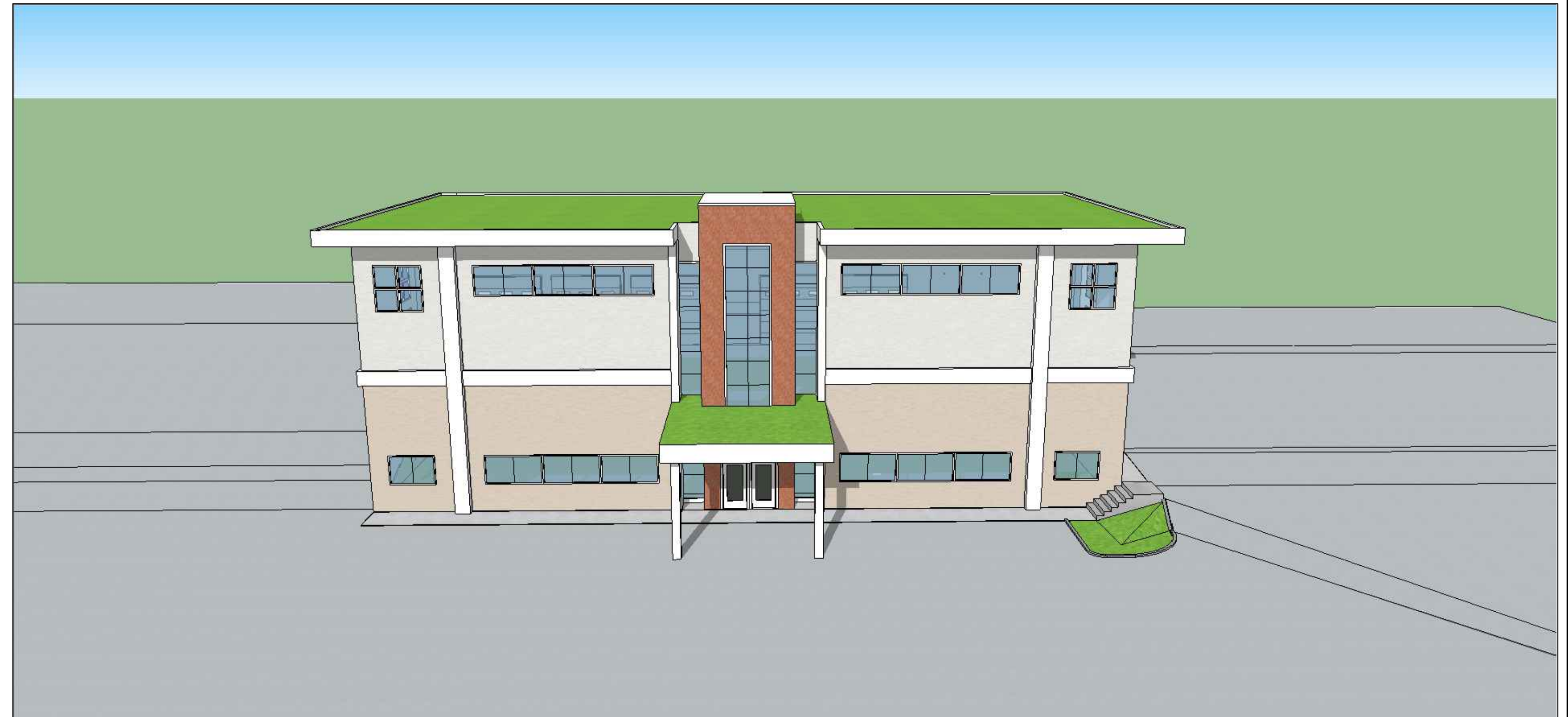
2 NORTH ELEVATION A3