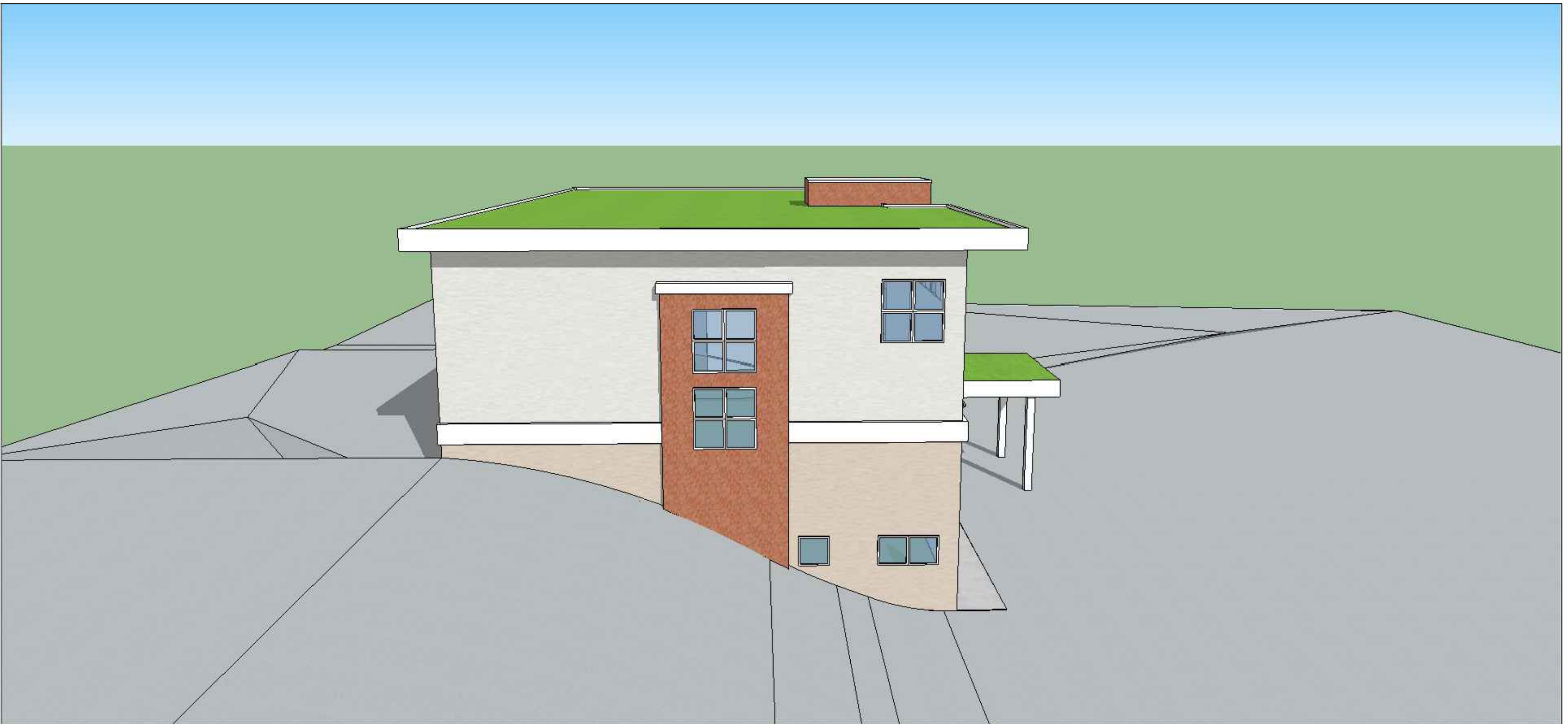
3 EAST ELEVATION A3